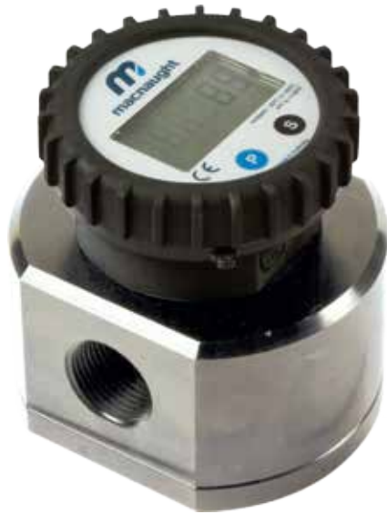
MX19P-1SE Stainless steel body with LCD register