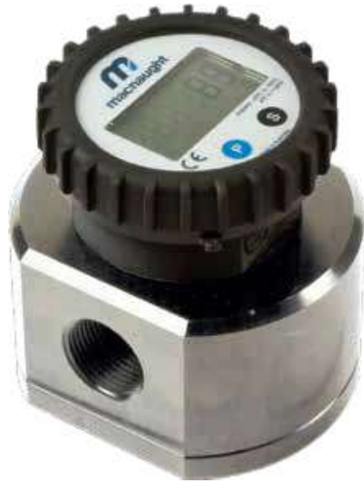
MX25P-1SE Stainless steel body with LCD register

A - Standard Pulse Reel/Hall Effect I - Standard Pulse Reel/Reed Effect J - Standard Pulse Hall/Hall Effect K - High Resolution Hall NPN