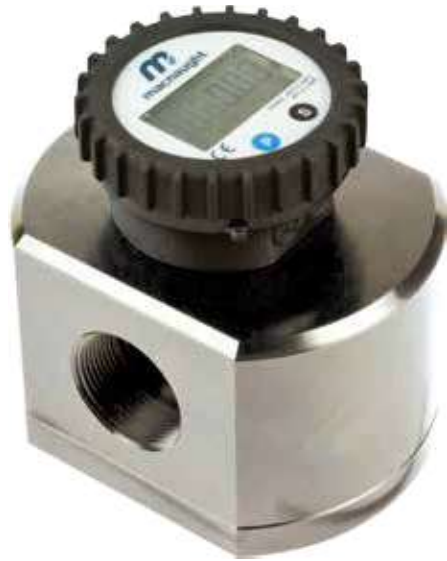
MX40P-1SE Stainless steel body with LCD register