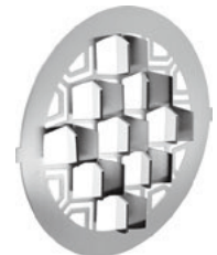
10" Flange Mounted