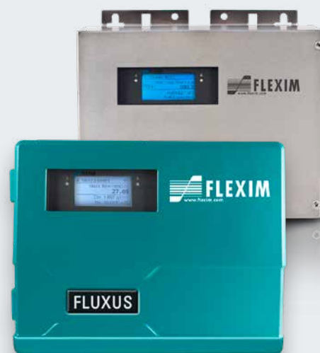
The FLUXUS® ST series is available for fixed installation and for portable use.

Two ultrasonic transducers are mounted with a defined distance onto the pipe. By sending sound signals alternatingly with and against the flow, a transit time difference can be measured. This corresponds to the flow velocity.