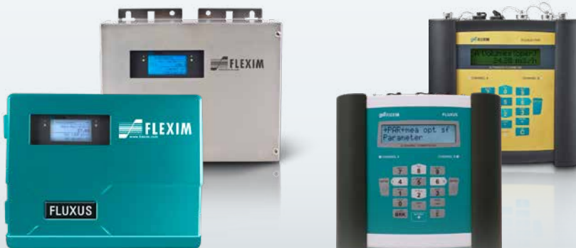
FLUXUS® G721 ST FLUXUS® G721 ST A2

More than 30 years of experience in non-invasive ultrasonic flow measurement