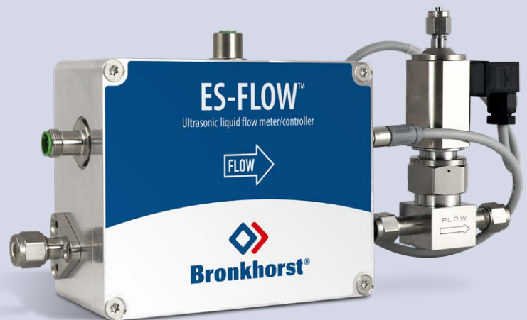
ES-113C/C2I Liquid Flow Controller