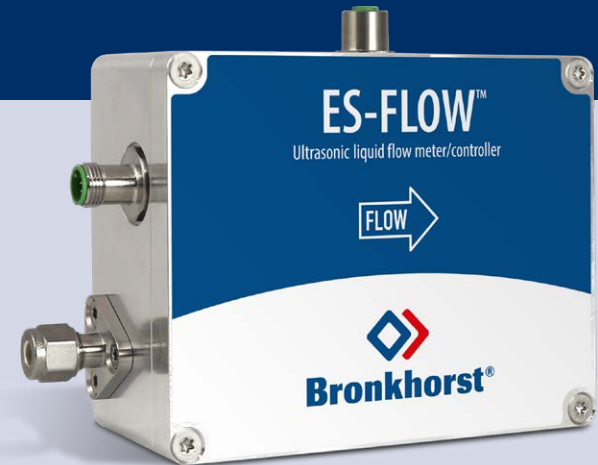
ES-112C or ES-113C Ultrasonic Liquid Flow Meter