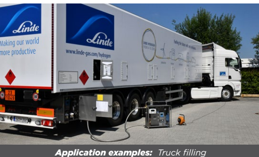
Application examples: Truck filling